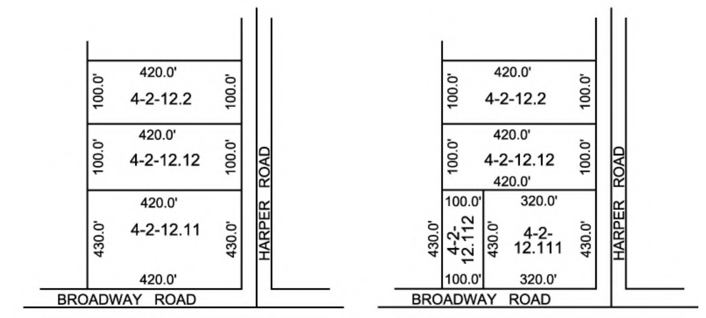
3. WHEN A PARCEL IS RESUBDIVIDED SUCH AS 4-2-12.1, THE PARCEL SOLD OFF BECOMES 4-2-2.12 AND THE RETAINED PORTION BECOMES 4-2-12.11.