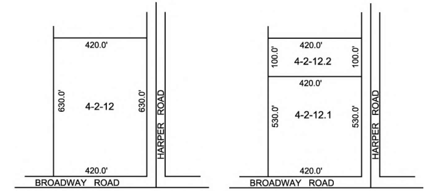
1. SAMPLE PARCEL SECTION-4, BLOCK-2, PARCEL-12.

METHOD OF NUMBERING PARCELS WHEN LANDS ARE DIVIDED OR SUBDIVIDED: