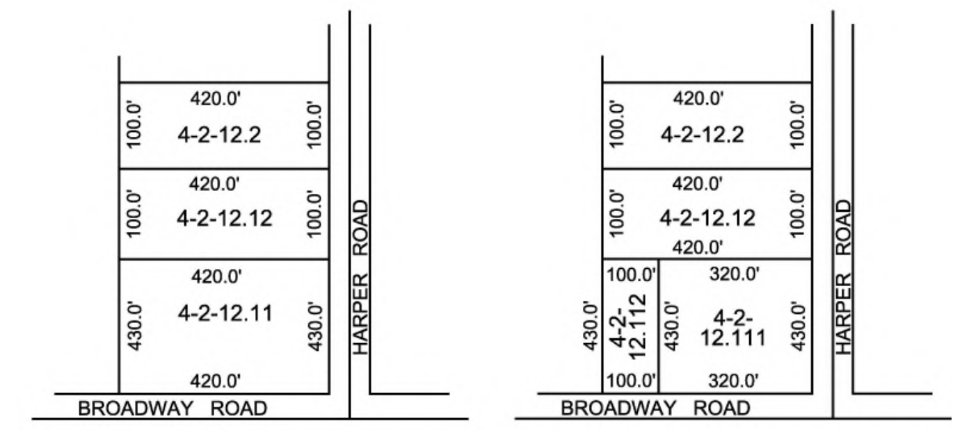
3. WHEN A PARCEL IS RESUBDIVISIONED SUCH AS 4-2-12.1, THE PARCEL SOLD OFF BECOMES 4-2-2.12 AND THE RETAINED PORTION BECOMES 4-2-12.11.