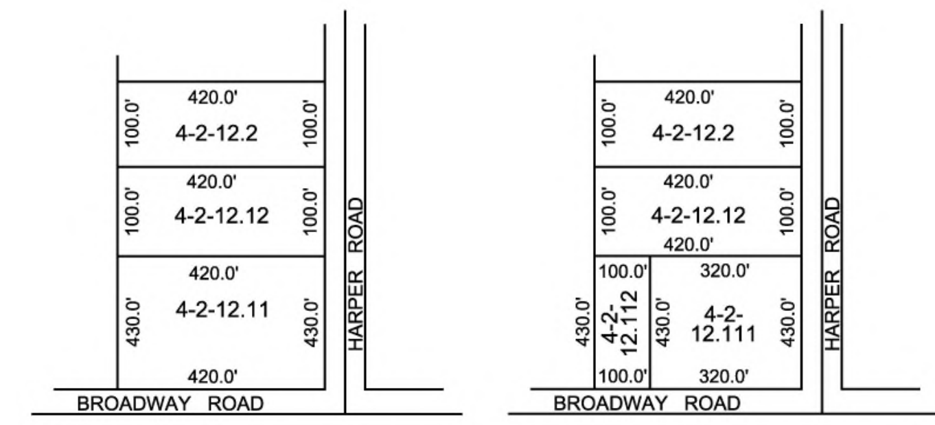
3. WHEN A PARCEL IS RESUBDIVISIONED SUCH AS 4-2-12.1, THE PARCEL SOLD OFF BECOMES 4-2-2.12 AND THE RETAINED PORTION BECOMES 4-2-12.11.