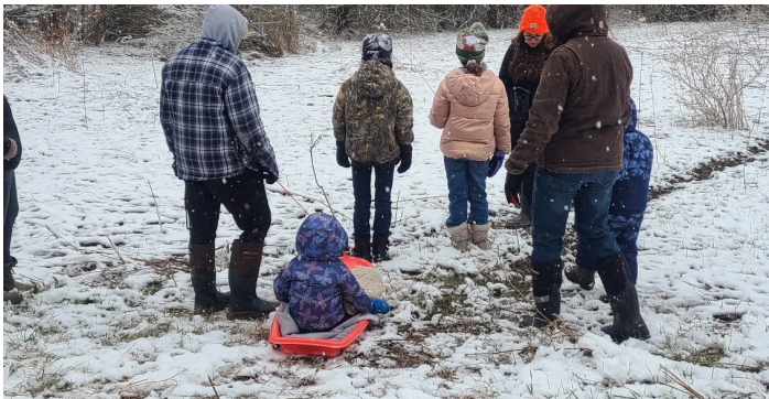
Spring Break Adventure Programs - in the snow!