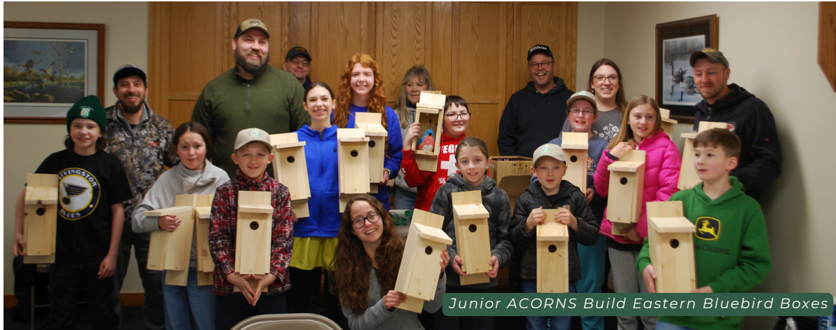
Junior ACORNS Build Eastern Bluebird Boxes