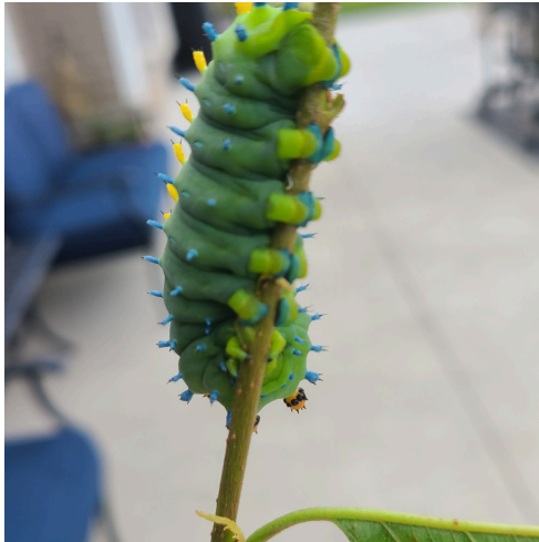
Charlie the cecropia caterpillar was found on one of the cecropias host plants, a cherry tree.

To my surprise I learned I had found a cecropia moth caterpillar. Cecropia moth caterpillars are born black and grow to be green, with four reddish knobs and 16 yellow ones. Well, that was it for me – he was going to come home with me, for a little while anyway. In my home we tend to name things that we find out in the wild – so our caterpillar was given the name, Charlie the Cecropia Caterpillar.