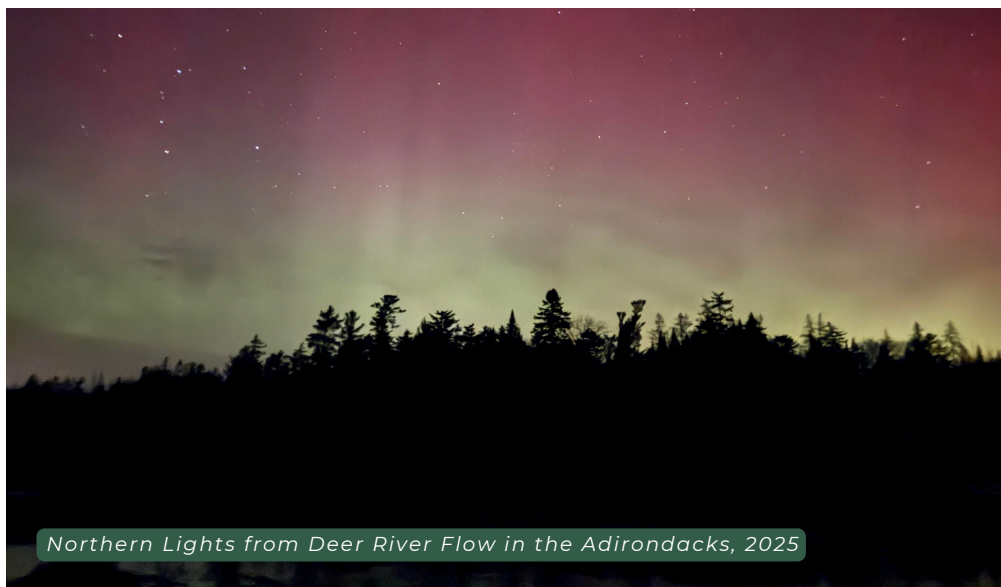
Northern Lights from Deer River Flow in the Adirondacks, 2025