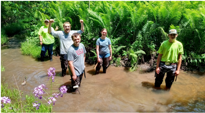
BOCES Conservation students install a temperature logger in Black Creek to study Creek health