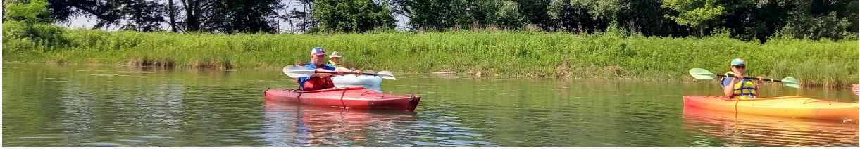
ACORNS Kayak Training at Beaver Island State Park

The ACORNS are the volunteer friends group for the Genesee County Parks. Here are our favorite photos from this past Spring. Thank you ACORNS for all that you do!