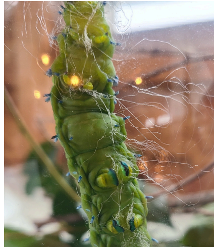
Cecropias belong to the silk moth family. They construct their cocoons from silk.