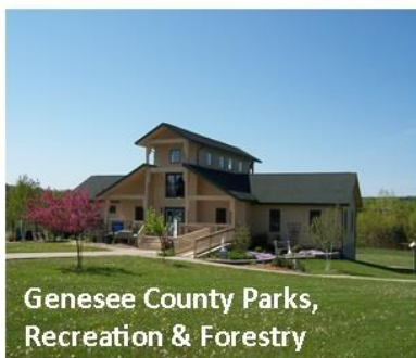
Genesee County Parks, Recreation & Forestry