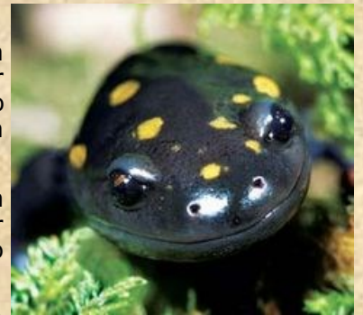
Spotted Salamander

Spotted Salamander Abundant but rarely seen, they spend most of their lives in tunnels under the forest floor, such as burrows made by moles and other rodents. Spotted salamanders emerge on rainy spring nights and migrate to vernal pools for mating. Their favorite foods are earthworms, insects and snails.