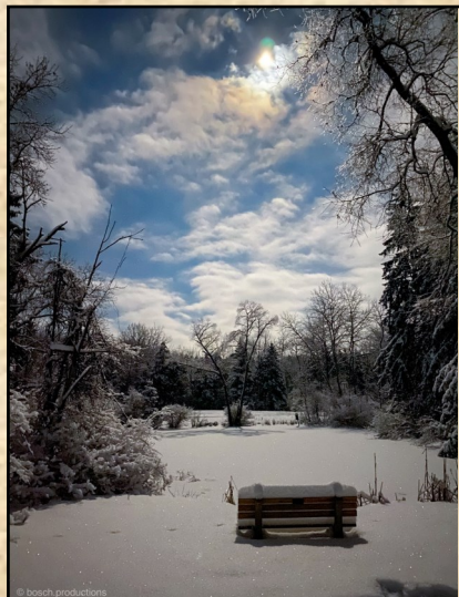
Moonlight glistens on a snow-covered pond.

Saturday snowshoe hikes were rescheduled due to weather, and our patience was rewarded! Families came out for some exercise and learning about animals in winter on January 25th and February 8th. Hikers discovered deer and rabbit browse, squirrel food caches, and identified tons of tracks! The night hike on January 25th gave us great exercise in the forest. Two weeks later the snow had decorated the forest, and everything sparkled as the moon peeked out of the clouds on the night hike February 8th. Hikers enjoyed the perfect temperatures, calm air, and fireside snacks.