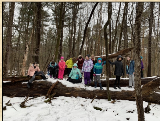
Scouts search for winter dens in the forest.

Girl Scouts of Western New York brought scouts to the forest on a beautiful day in January for a winter ecology hike. The snow had captured all of the nighttime hunts and travels of forest wildlife. Scouts found, followed and learned to identify opossum, raccoon, fox, coyote, mouse, red squirrel, grey squirrel, eastern cottontail, and deer tracks. They discovered buck rubs and deer beds in the forest, walked through deep snow in the meadow and watched woodpeckers and chickadees eating at the bird feeding station. It was a great day for exploring!!