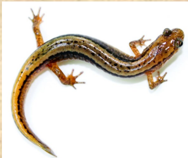
Northern Two-lined Salamander

Northern Dusky Salamander The larvae live in streams for 2 to 3 months, then emerge onto land. Adults are always found near a stream edge. They may be many shades of brown and grey and their hind legs are much bigger than their front legs. The sharp keel along the tops of their tails tells them apart from Mountain Dusky Salamanders, which have a round tail. Dusky Salamanders can jump surprisingly far when they want to escape! They lay their eggs in wet leaf piles, moist logs, or under rocks in creeks and defend their clutch from being eaten by other salamanders.