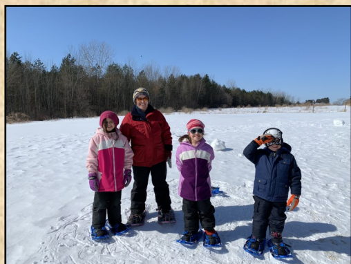
Aunt and kids seize their day in the sun and rent snowshoes at the park!

Hilton-Parma Rec Winter Camp and Albion 4th Grade students came to the Genesee County Park & Forest for the Winter Ecology program! Kids explored the forest and learned about animal adaptations for survival, did a wildlife