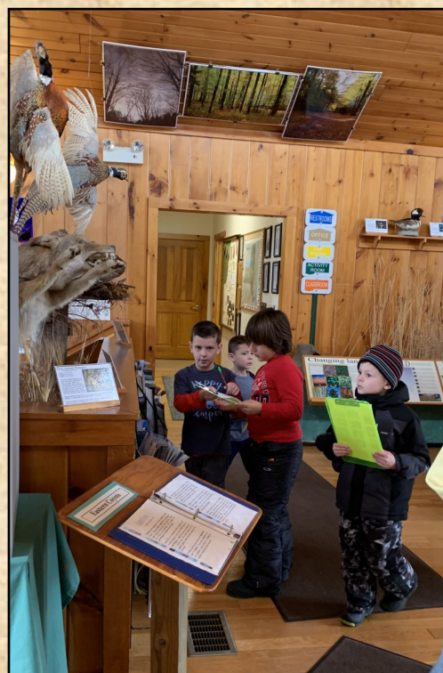
Hilton-Parma Rec Winter Camp kids enjoy a wildlife scavenger hunt in the Interpretive Nature Center.

In addition to leading and assisting winter hikes and activities, ACORNS members have been busy hosting the front desk of the Interpretive Nature Center and providing snowshoe rentals. Snowshoes are available for rent Thursdays and Fridays 10 am to 3 pm, Saturdays and Sundays 12 pm to 3 pm. We look forward to seeing you for your next adventure!