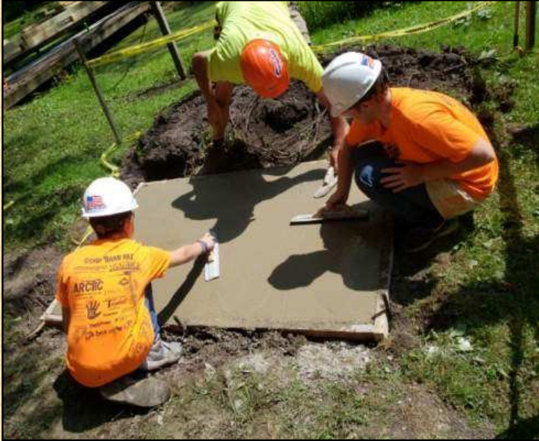
Campers install a concrete pad for a memorial bench.

Learn about careers in construction where you actually build parts of a community project! Instructed by certified teachers and GVEP Building Trades Instructors.