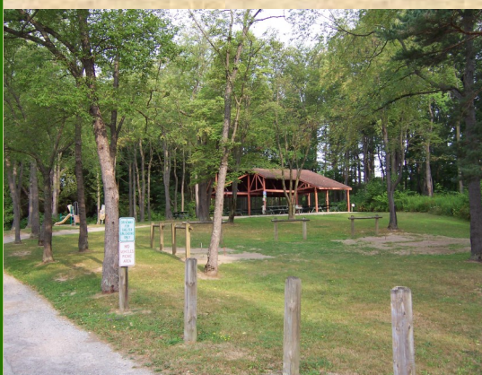
Pavilion D before...

The Grand Opening of the newly rebuilt Pavilion D on Saturday, August 24th was a blast! Many thanks to the ACORNS for hosting a fun, hot-dog heavy shindig to celebrate the amazing work done on Pavilion D by Genesee County Facilities, Highway and Parks staff. Many thanks to the ACORNS volunteers who came and assisted staff as well! Kudos to all involved!!!