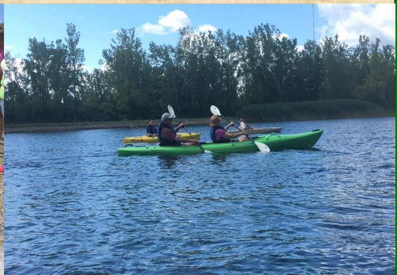
Now that's some skilled tandem kayaking!!