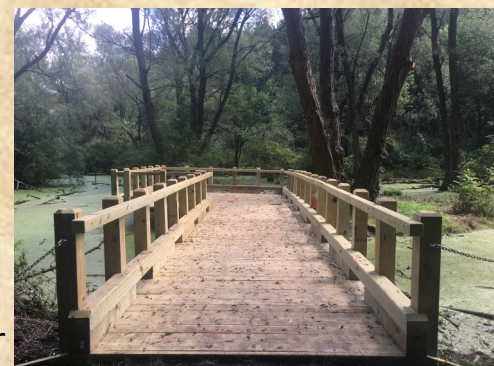
And after!! Wow!!