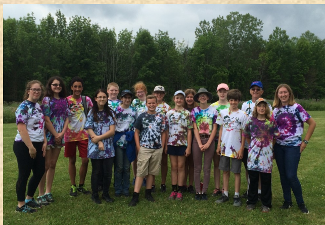
Environmental Science Campers last day of camp.