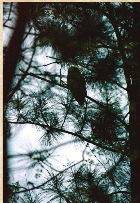
Barred owl spotted during an evening Owl Prowl at Genesee County Park & Forest in May.