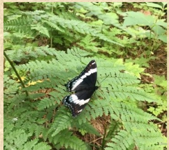
A White Admiral butterfly found during a school program dries its wings after recently emerging from its chrysalis.