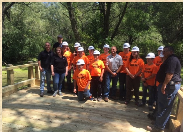
Camp Hard Hat Campers pose for a photo on their finished project, a walkway over the wetland on the Wildlife Trail.