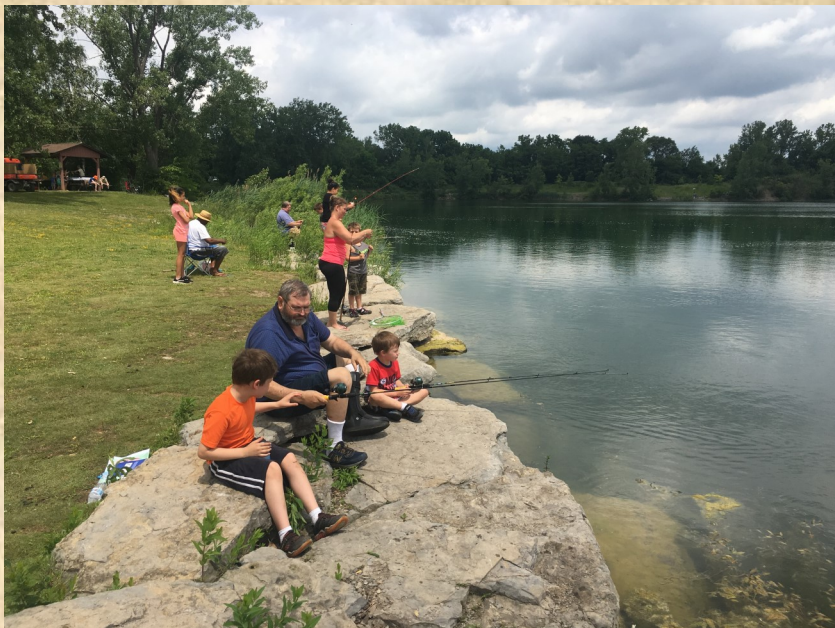
Families see what they can pull out of the lake. Bass, brown trout (500 stocked annually by the DEC), carp, pike, bluegill, and perch were all on the table.