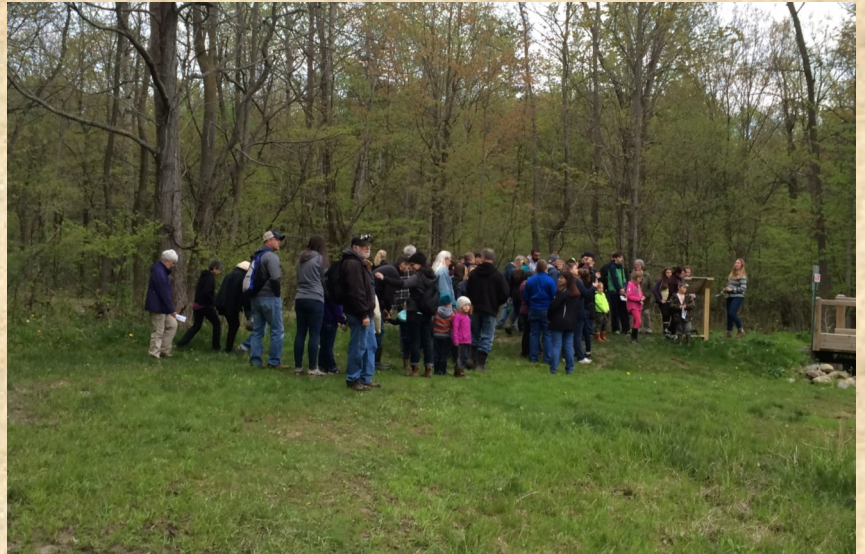
One week in and already leading 60 people through an Owl Prowl!! We were lucky enough to hear and see owls!

My favorite memories from this summer are ones from when I was watching the people at our programs; students, adults, young and old, so thoroughly enjoy what they were doing. Programs such as the Owl Prowl, when 60 people were able to be dead silent and absolutely enthralled listening and looking at a barred owl overhead for over 20 minutes. When families got so into dip netting and catching critters in Turtle Pond that they fell into the water. Third graders who sprinted back and forth in the Outdoor Learning Center, never slowing as they tried to collect all of the geocaches, dragging their tired chaperones behind them. Fifth graders sprinting around the front lawn, trying to eat as much "wheat" as they could without being eaten by "predators", and then be able to make the connections between biomagnification and the game of tag they just played. Seeing people have so much fun learning was definitely a big *WOW* moment for me this summer, and I'm so thankful that I've had the opportunity to be a part of those moments and so many more.