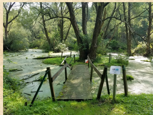
Wetland walkway before...