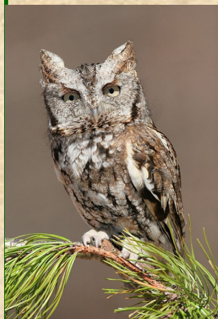
Eastern Screech Owl