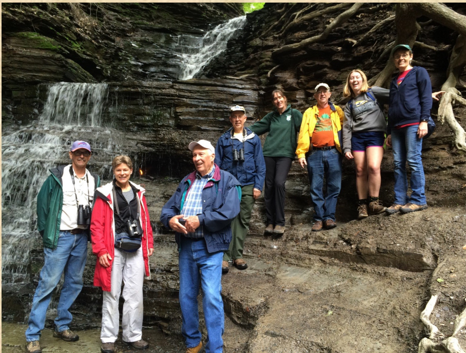
ACORNS members at the Eternal Flame Falls in Chestnut Ridge Park. You can see the flame flickering in the background!

The first ACORNS adventure of the summer was supposed to be kayaking, but due to high winds we decided to stay off of the water. Instead, we took a jaunt on over to one of the biggest county parks in New York State, Chestnut Ridge County Park, located in Orchard Park. Located within Chestnut Ridge Park is an incredible natural feature known as the Eternal Flame Falls. Sunken into the shale which the waterfall