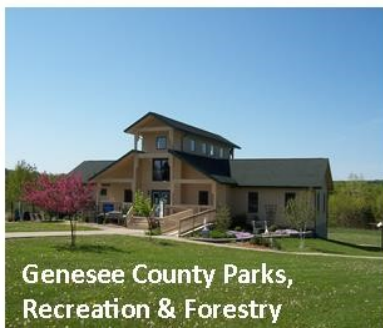
Genesee County Parks, Recreation & Forestry