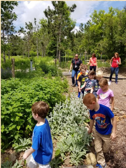
Leroy 1st Graders explore the Sensory Garden in the OLC