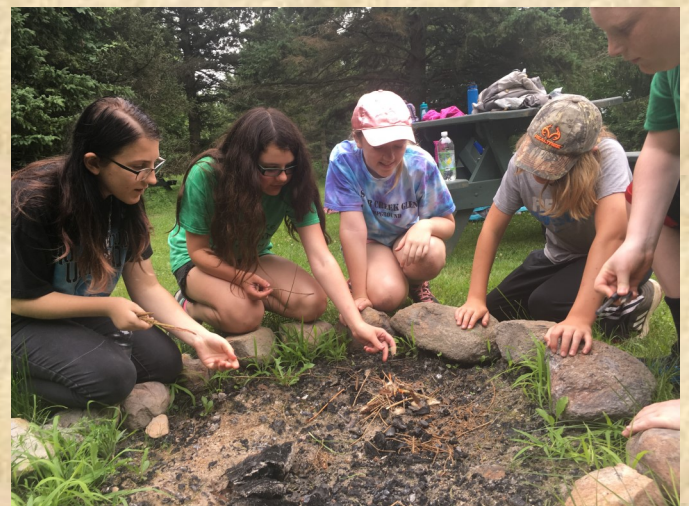
Environmental Science campers work together to start a fire