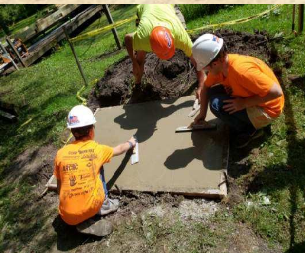
Camp Hard Hat campers work together to create a concrete pad for a new bench which was dedicated to the Tambe family of Tambe Electric.