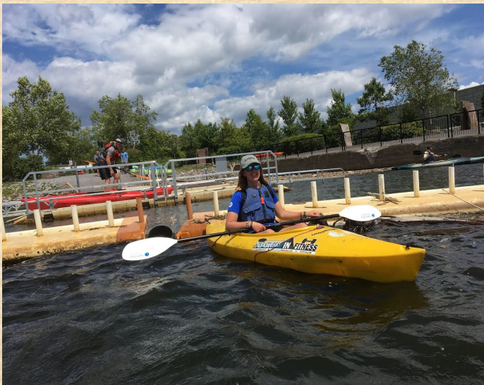
Kayaking on the Buffalo River during the ACORNS volunteer outing!