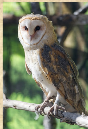
Barn Owl