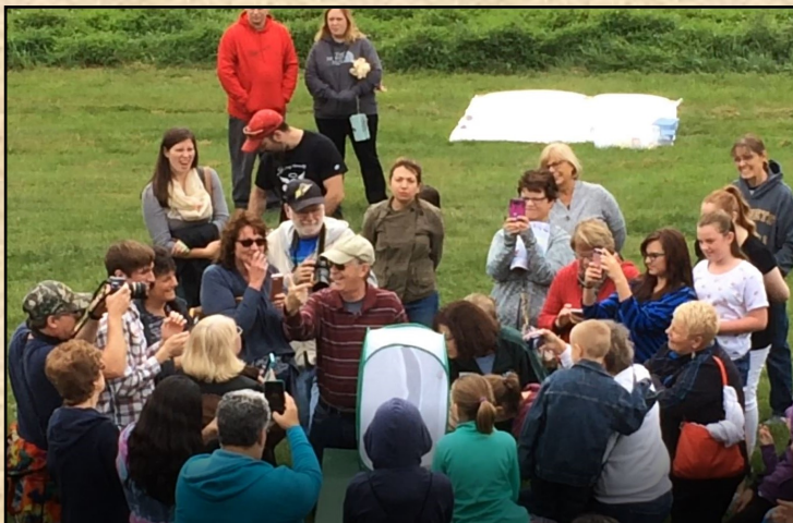
Park volunteer releases a tagged Monarch butterfly during park program Watching Monarchs