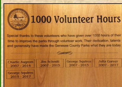
1000 Volunteer Hours plaque at the Interpretive Nature Center