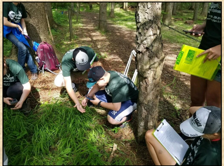
ESCE Campers report invasive species