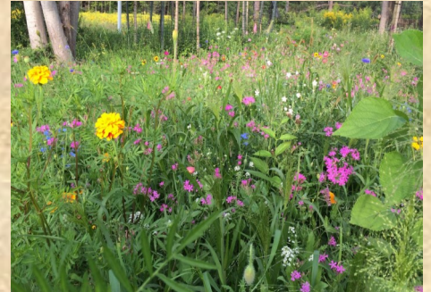
New pollinator garden in bloom

This Summer brought full bloom to the ACORNS OLC! The pollinator garden planted by Girl Scout Troop 42214 of Elba sprouted into a burst of color. A multitude of wildflowers greets beneficial pollinators, black-eyed susans, bachelor's buttons, sweet William, and marigolds. Thank you to Troop 42214 for providing this beautiful habitat in the OLC!