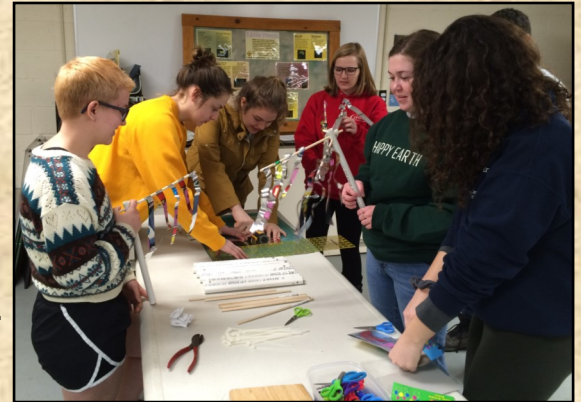
FORCES create "sparrow spookers"

Flashback to January of 2018, when FORCES volunteers from SUNY Geneseo teamed up with ACORNS to create better bluebird boxes. In effort to eliminate nest parasitization and predation by House Sparrows and House Wrens, "sparrow spookers" were created from dollar store birthday banners and pvc tubing. As recommended by Carl Zanger of Iroquois National Wildlife Refuge, the shiny mylar strips flutter in the wind and scare away House Sparrows from the nest box. However, scary as the shiny things are, they do not deter the Eastern Bluebirds from occupying and returning to the nest box. We took Carl's advice. Volunteers created the new nest boxes and sparrow spookers during the winter. Sparrow spookers were then installed on top of each nest box immediately following the laying of the first egg.