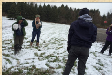
First snowball fight of the season!