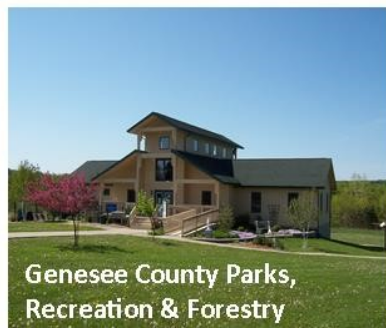
Genesee County Parks, Recreation & Forestry