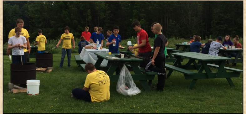
Camp Hard Hat enjoys outdoor cooking for dinner