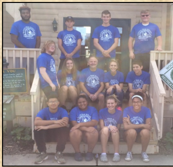
Thank you Batavia HS Seniors!