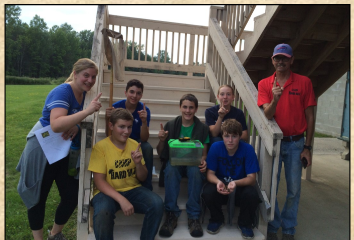
The winning team of Camp Hard Hat overnight scavenger hunt competition