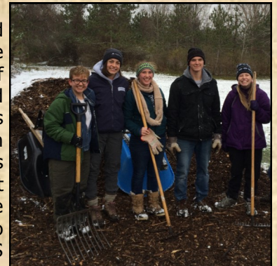
SUNY Geneseo FORCES brave the snow to volunteer

The ACORNS kept up with landscaping and garden maintenance during work days over the summer and fall. The SUNY Geneseo chapter of Friends Of Recreation, Conservation and Environmental Stewardship (FORCES) joined us in finishing the last round of mulching work in the OLC landscape on November 10th. It was the first day of wintery weather this fall, but that didn't stop them from getting work done and having a blast doing it! Thanks to all who volunteered and worked on making the ACORNS OLC more beautiful and functional this year!